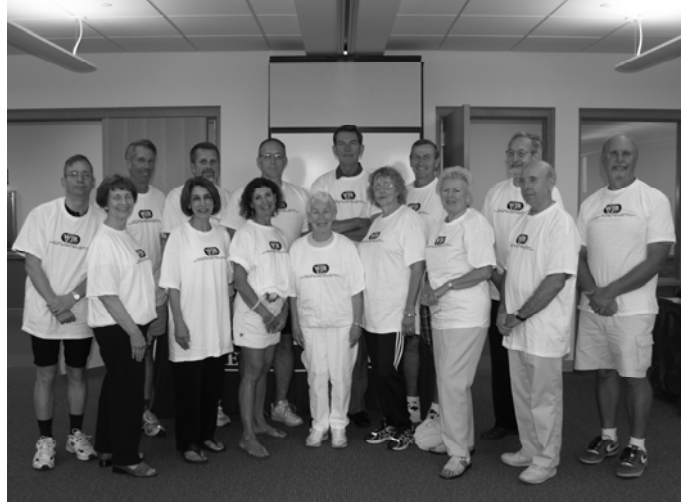
New Event! Martial Art Form