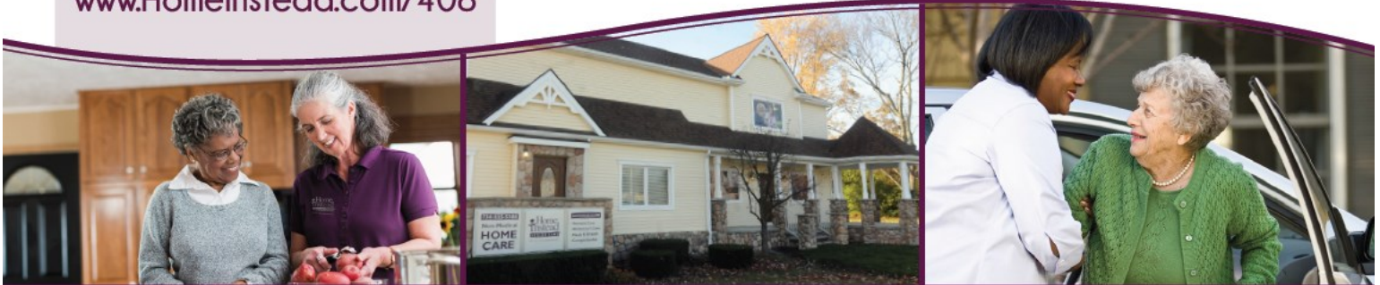
ACHC Accredited - Accreditation Commission for Health Care • Each Home Instead Senior Care office is independently owned and operated.

Home Instead services support your independence.